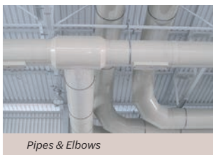
Pipes & Elbows