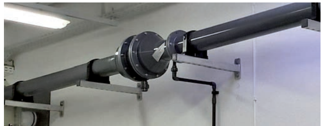
Various industries: tanneries, etc.

In both heavy and light chemicals, the production and transformation processes call on extensive wide range of chemical elements; resulting in a wide variety of polluting gaseous emissions: our job is to define and set up the optimal treatment solution in line with your requirements and those of the regulations in force.