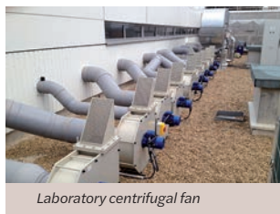
Laboratory centrifugal fan