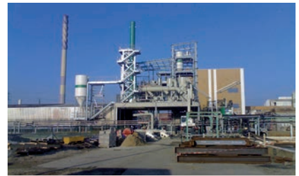
Light & heavy chemistry