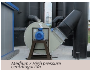
Medium / High pressure centrifugal fan