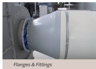
Flanges & Fittings