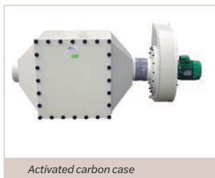
Activated carbon case