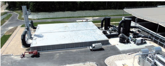
Treatment of waste & composting