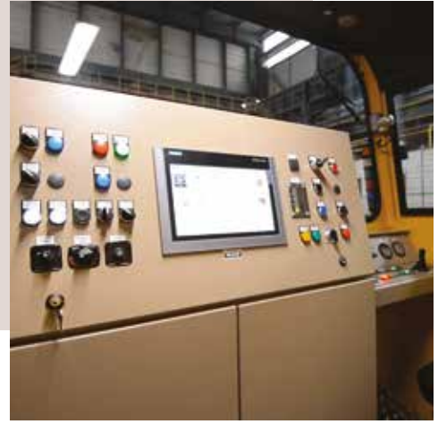
Ergonomic driver desk with joysticks for traction/brake control