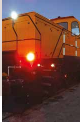
Comfortable driver's cabine