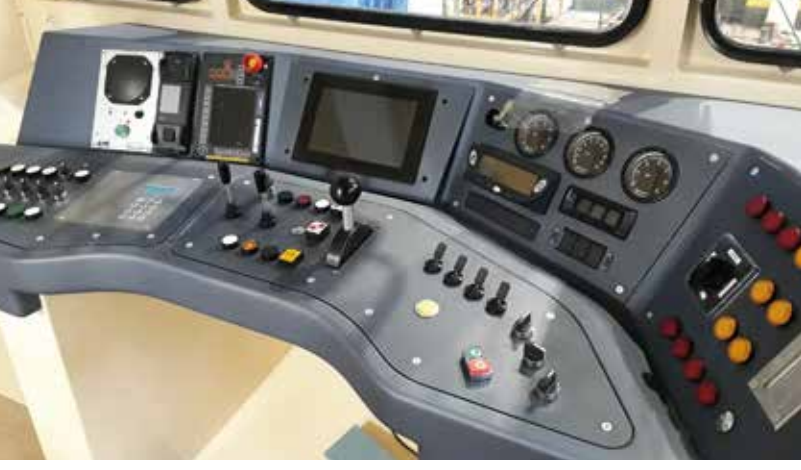
Control panel (1 dashboard per cabin)