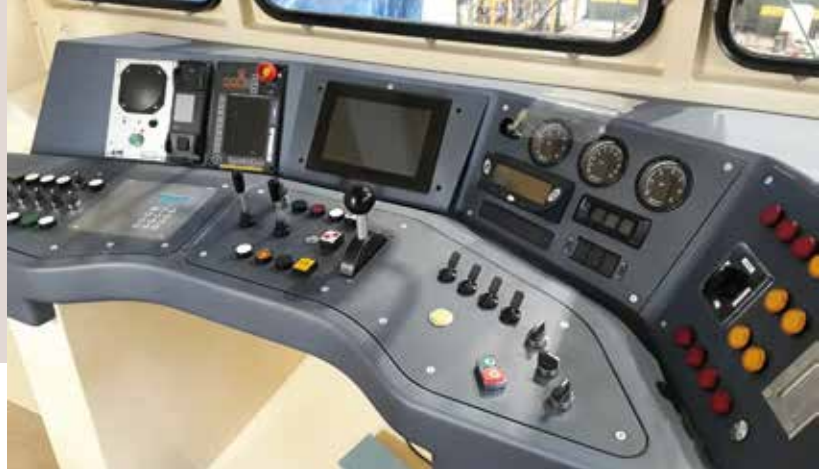
Control panel (1 dashboard per cabin)