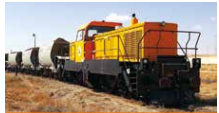
NH 700 BB 750 CV - 35 km/h