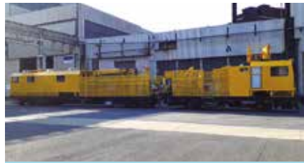
Hybrid Catenary Maintenance Vehicle 550 CV - 100 km/h