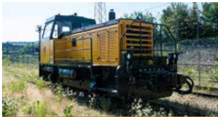
NH 300 B 350 CV - 30 km/h