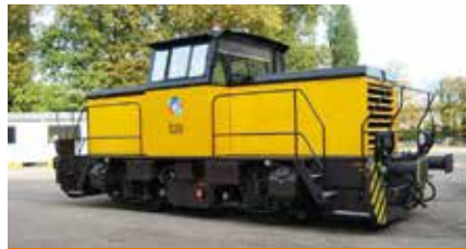
NH 500 B 525 CV - 60 km/h