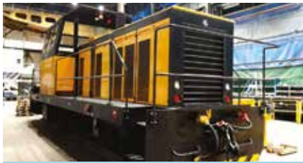
DE 600 C 612 CV - 50 km/h