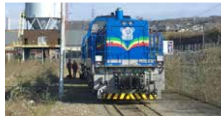
DE 1200 BB 1200 CV - 90 km/h